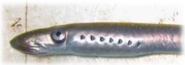
Juvenile Pacific Lamprey